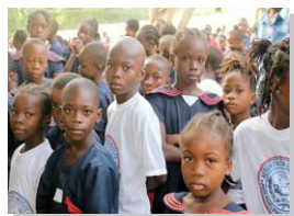
Children returning to school in Liberia